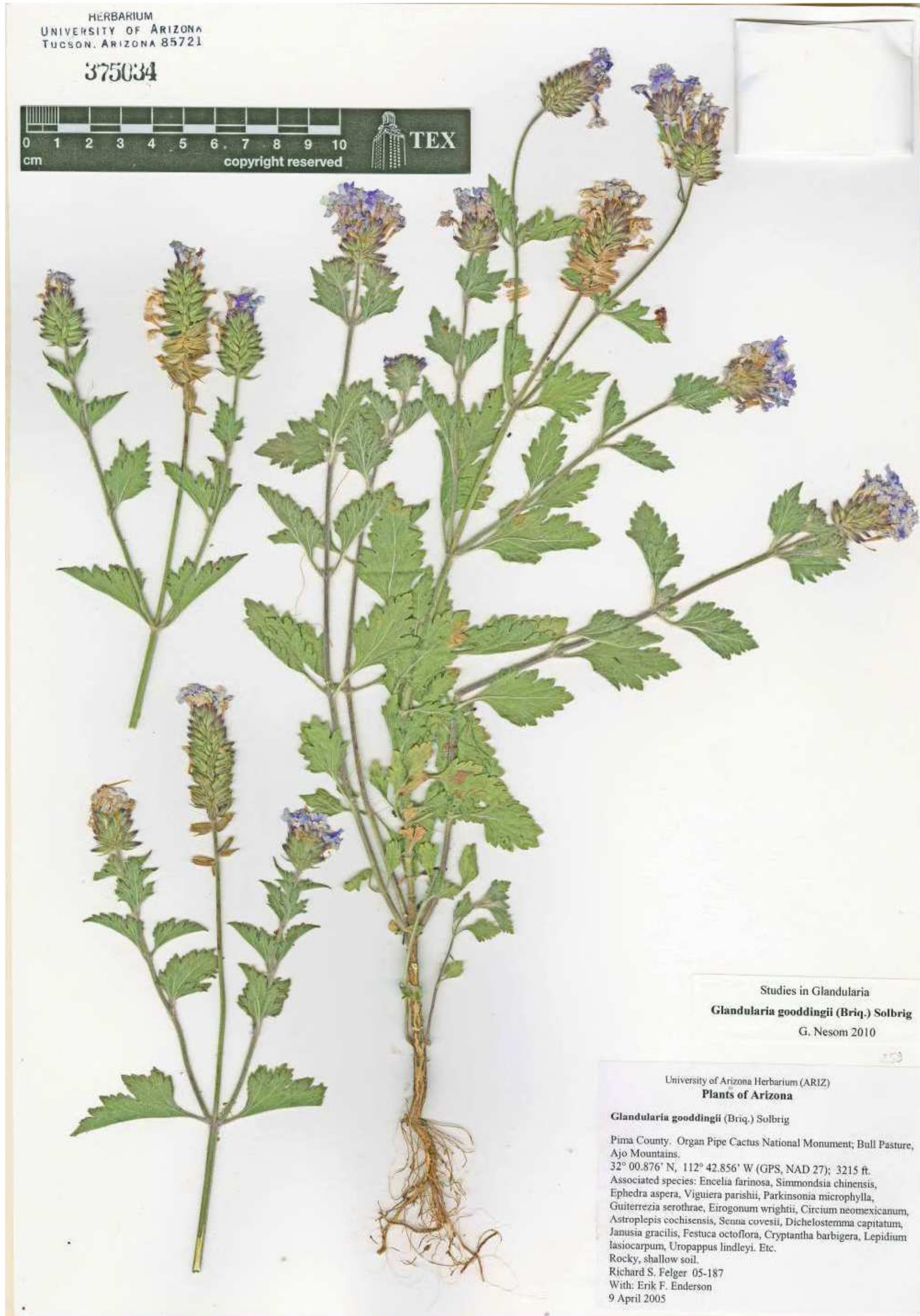
Figure 3. Glandularia gooddingii , leaves coarsely toothed to incised.